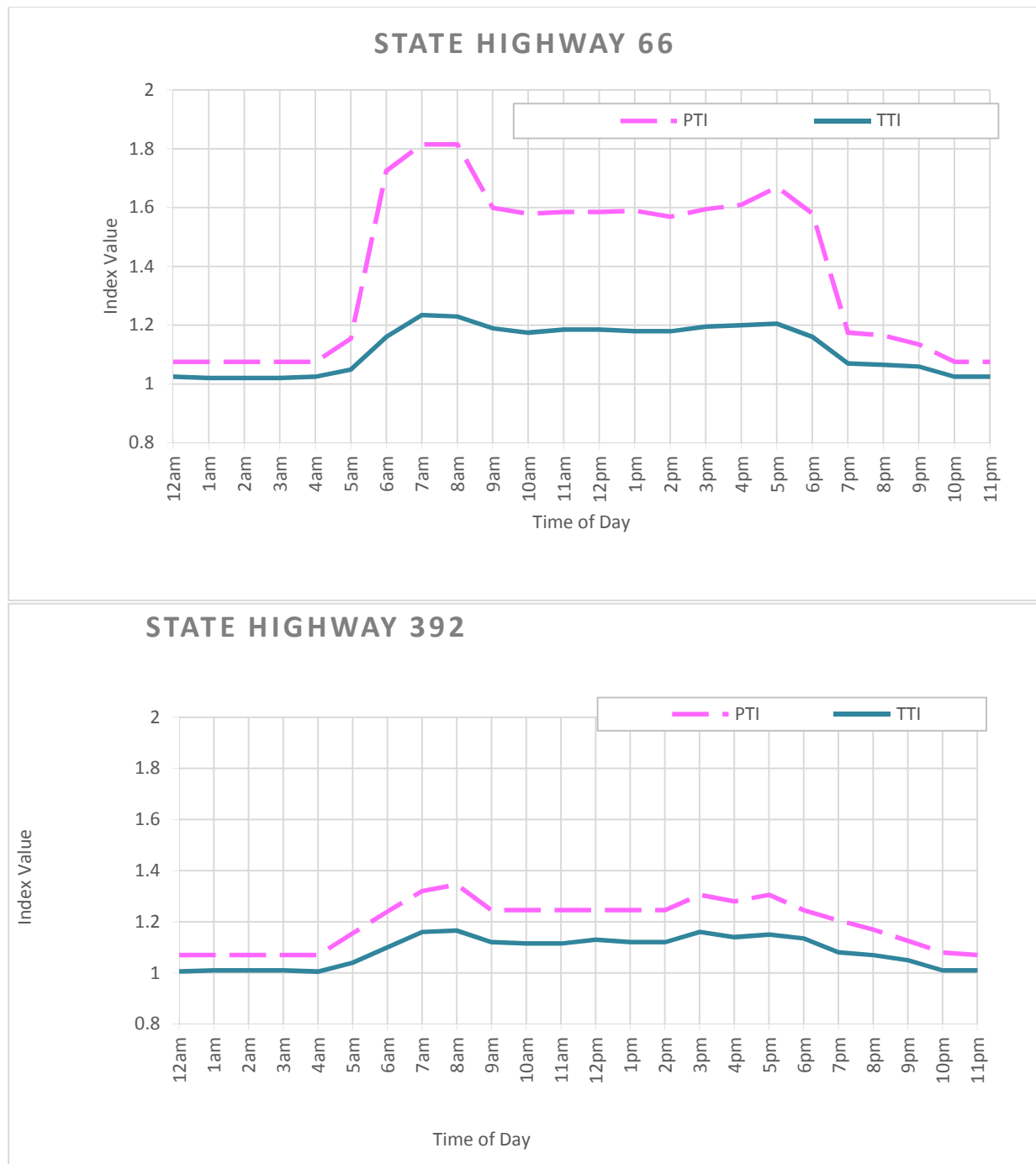
Figure 5-2: Travel Time Index and Planning Time Index throughout the Day

A literature review has been conducted to determine if there was a BI threshold to indicate non-recurring congestion. Results of the review were inconsistent with agencies that use this measure to identify non-recurring congestion using a variety of measures generally ranging from 0.25 to