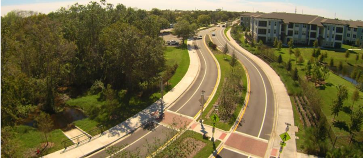
Figure 1: City of Casselberry Complete Street