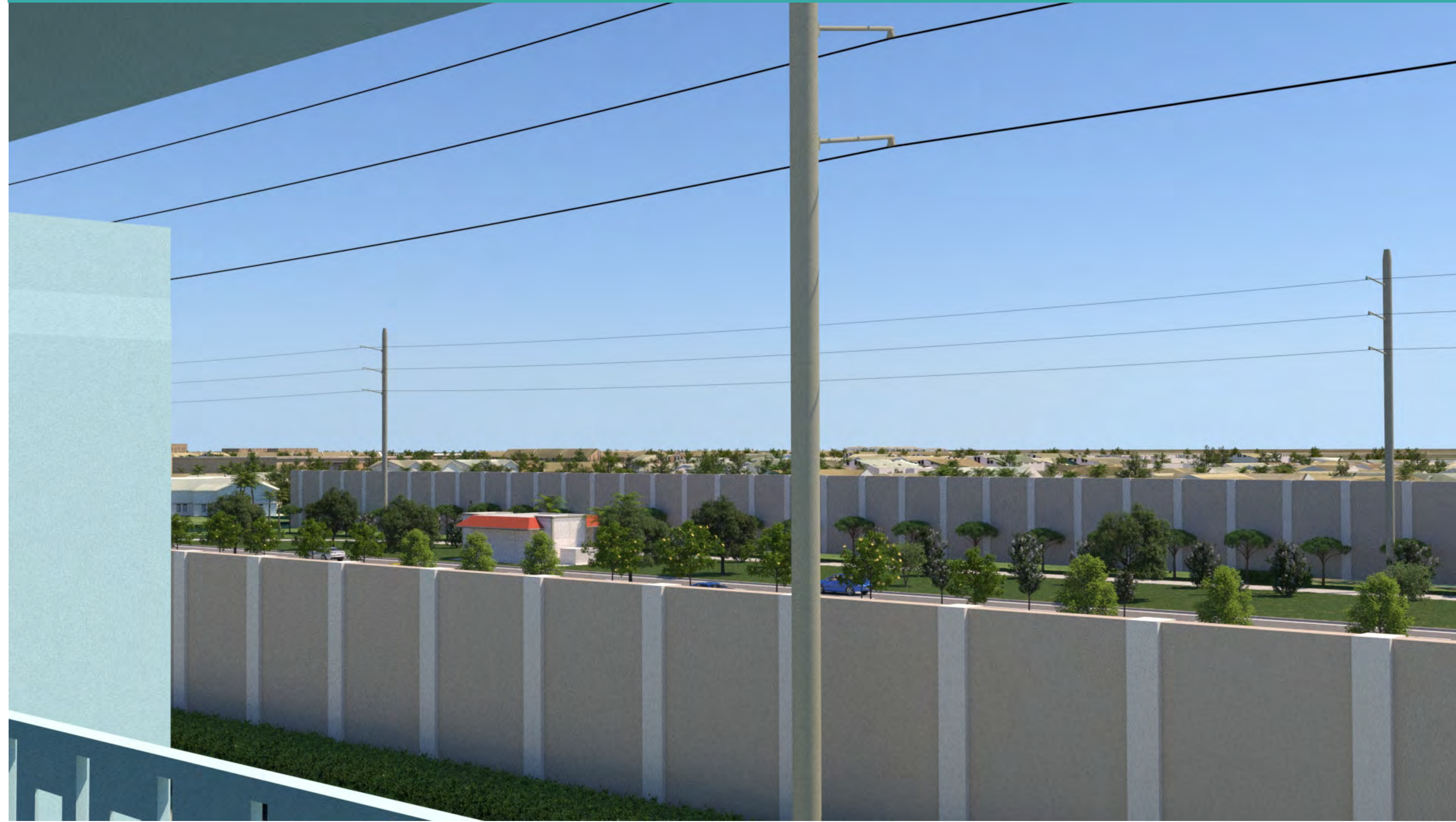
Century Village Balcony looking East