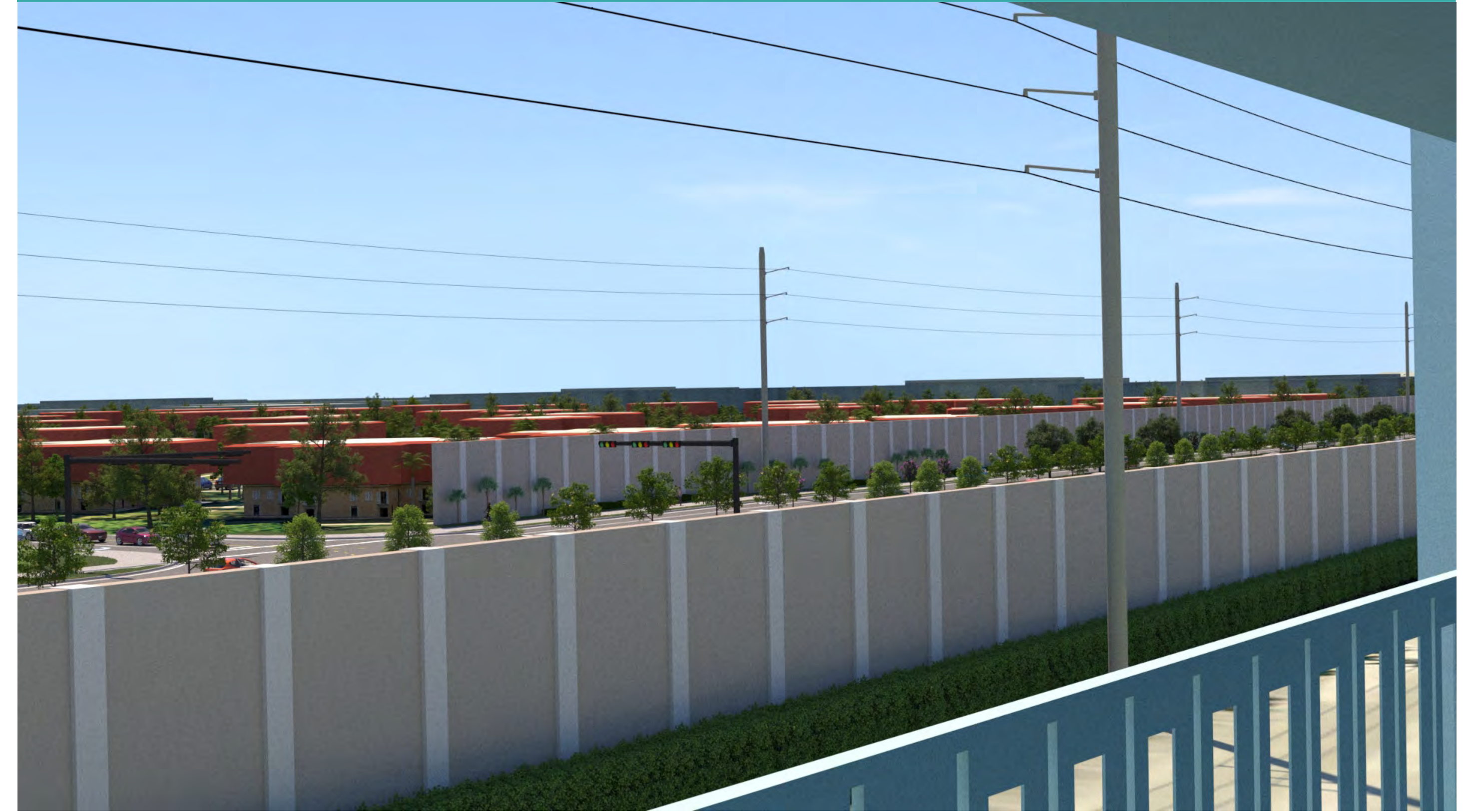
Century Village Balcony Looking West