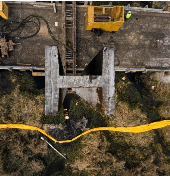
Pile driving photos