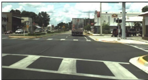
Special Situation 2