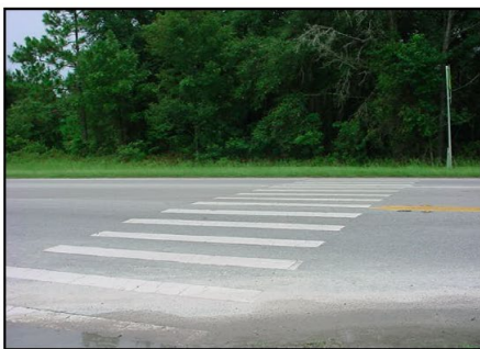
Special Situation 1

For consistency, when state roadways intersect, record crosswalk inventories to the roadway that they exist on. If the below characteristics are located at a rest area, ramp, or other applicable sub-section, they are to be inventoried against the applicable sub-section number.