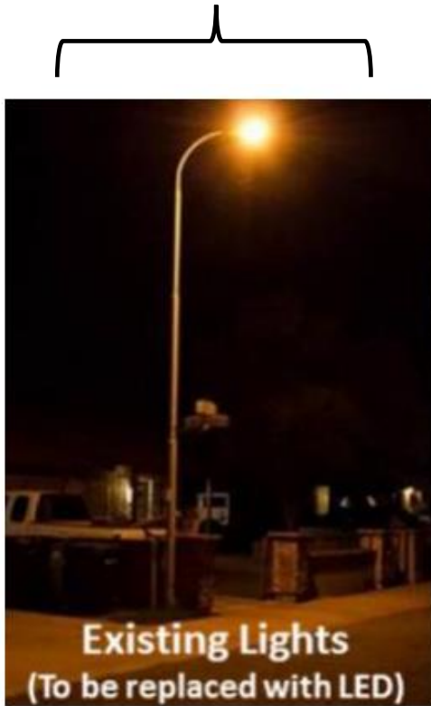
Existing 2200 Kelvin HPS