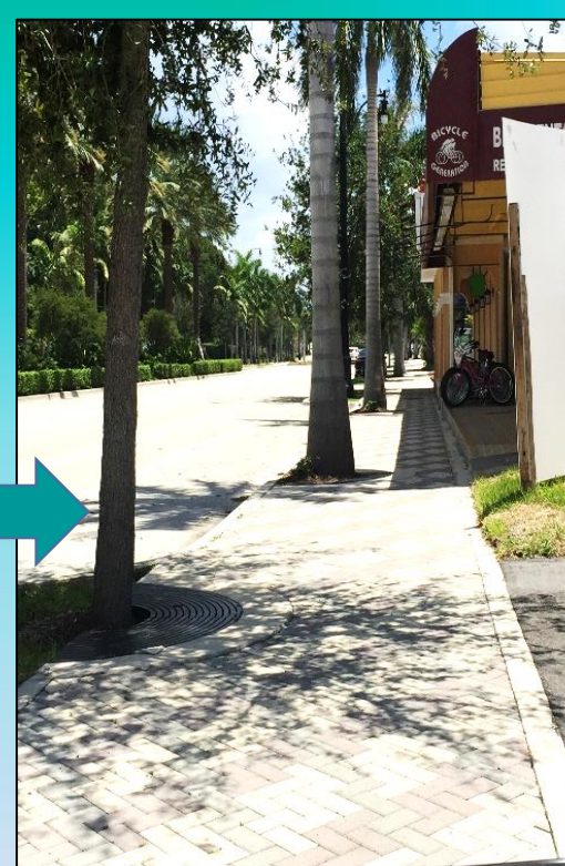
Existing sidewalk east of SR 5/US 1 (Federal Hwy) showing paver sidewalk and landscape plantings. This is the design intent for the proposed areas between SR 811 (Dixie Hwy) and SR 5/US 1 (Federal Hwy).

The current FDOT phase from SR 811 (Dixie Highway), east to SR 5/ US 1 (Federal Highway) will remove suicide lanes, install medians, expand sidewalks, create bike lanes and bus bays. This is the area for the proposed Beautification grant.