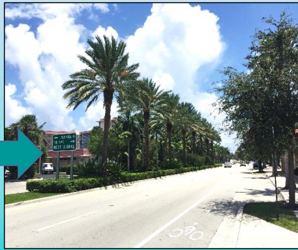
Existing median east of SR 5/ US 1 (Federal Hwy) showing landscape plantings. This is the design intent for the proposed areas between SR 811 (Dixie Hwy) and SR 5/ US 1 (Federal Hwy).