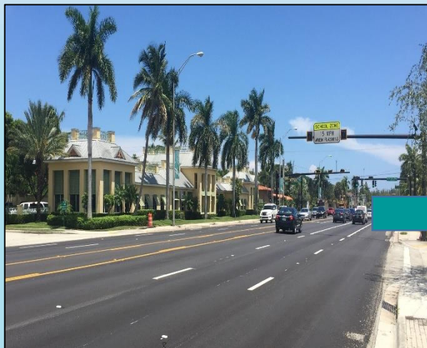
Existing suicide lane on SR 810 (W. Hillsboro Blvd.) between SR 811 (Dixie Hwy) and SR 5/ US 1 (Federal Hwy).

Beautifying Hillsboro Boulevard from Dixie Highway to Federal Highway