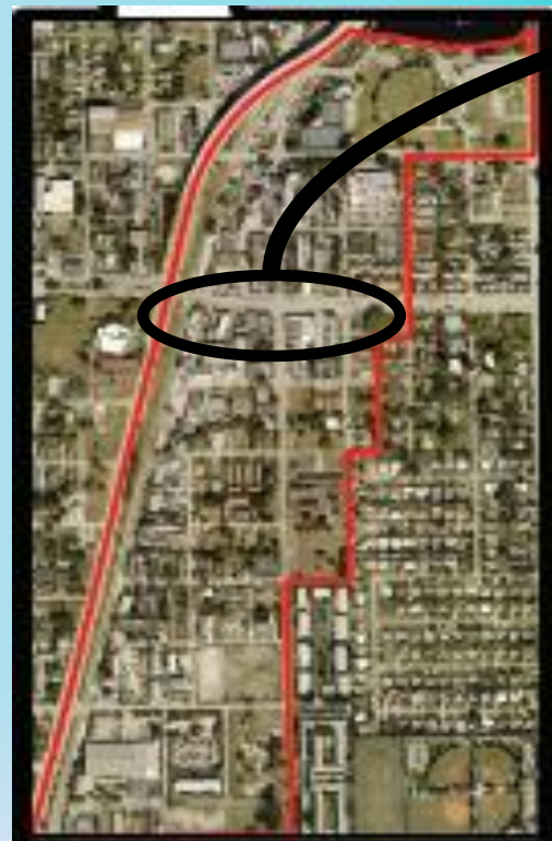
Pioneer Grove Boundaries shown in red. Circled area is SR 810 (Hillsboro Blvd.) from SR 811 (Dixie Hwy) to SR 5/US 1 (Federal Hwy).