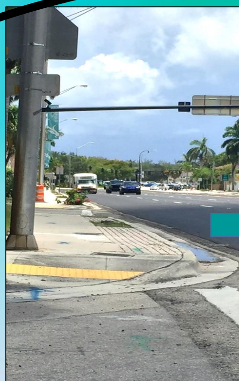
Existing sidewalk on SR 810 (Hillsboro Blvd.) between SR 811 (Dixie Hwy) and SR 5/US 1 (Federal Hwy).