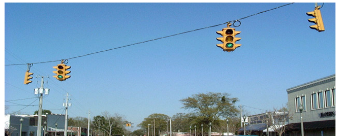
Single cable system on SR 26 in Newberry, Florida.

The researchers built a test site and conducted 31 wind load tests on the systems. They subjected each system to wind speeds of up to 115 miles per hour. Each system supported a five-head traffic signal during the experiments. The researchers measured wind speed, signal rotation, and cable tension. The tests showed that signal rotation on both systems allowed 50 percent direct signal light visibility at wind speeds of 70 MPH (extreme thunderstorm and pre-hurricane). However, during high-velocity (hurricane) winds, the dual-cable configuration showed significant tension increases in the messenger cables, with accompanying force increases in the hanger, disconnect box, and poles. The single-cable system experienced little increase in cable tension; the system behaved like a simple pendulum.