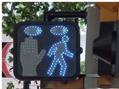
Figure 3 – Animated eyes display

Animated Eyes: The animated eyes display is a signal indication that features eyes that oscillate between looking left and right in order to remind the pedestrian to look both ways before entering the crosswalk. Figure 3 shows an animated eyes display in use at an intersection in Clearwater 4 .