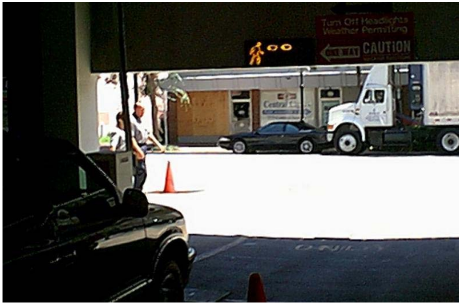
Figure 4 – Animated eyes at the exit to a parking garage

Countdown signal : Probably one of the most useful pedestrian ITS treatment is the pedestrian countdown signal. This device displays to the crossing pedestrian the remaining time that they have to cross the street. Past studies have indicated that a very small proportion of pedestrians understand the meaning of the flashing hand display. Figure 5 shows a countdown display added as a retrofit to an existing pedestrian signal.