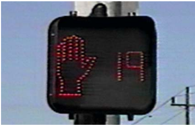
Figure 6 – Integrated pedestrian countdown signal

Studies on the countdown signal indications have typically shown a dramatic reduction in the number of pedestrians remaining in the crosswalk at the end of the flashing DON'T WALK. However, some studies do indicate that the presence of the countdown increases the number of people that will enter the crosswalk after the WALK period has expired. This is understandable and should be expected since the flashing DON'T WALK is typically timed for a relatively slow pedestrian walk speed. Pedestrians that walk faster, or those who may chose to jog or run across the intersection now have information that allows them to make a decision on whether they can make it or should wait. A previous study by the FDOT recommended that “countdown signals are not recommended for use at standard intersections in Florida 6 .” However, many of the local maintaining agencies are currently implementing countdown signals at any intersection that is being rebuilt or refurbished. The maintaining agencies indicate that the pedestrians desire the countdown displays and readily understand them.