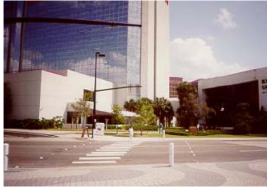
Figure 1 – Daytime view of in-pavement light installation

system is activated and the lights begin to flash for a predetermined period of time. Figure 2 shows the same location at night from the street view.