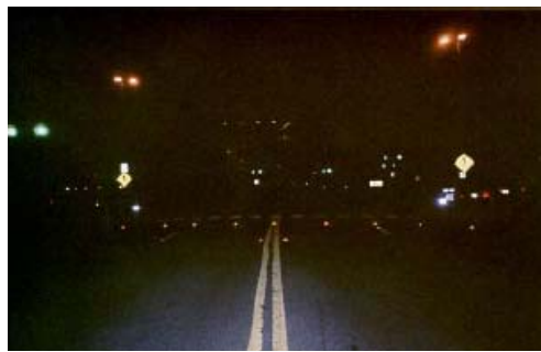
Figure 2 – View of in-pavement lighting at night

It is important to note that these systems should only be used on relatively narrow low-speed roadways. One of the primary concerns that the engineer must consider is that the approaching motorist must have adequate decision sight distance for the illuminated crosswalk. If the approaching traffic is traveling too fast, even once a driver perceived the crosswalk, they may not be able to safely come to a stop prior to entering the crosswalk. If the roadway crossing is too wide, it may expose the pedestrian to traffic for too great a period of time.