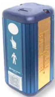
Figure 7 – Accessible pedestrian signal

Figure 7 shows an accessible pedestrian signal that includes both auditory and tactile features. Tactile features on the signal include a Braille map of the intersection and raised features to help a sight-impaired pedestrian find the correct button and the crosswalk. The arrow on top indicates the direction of the crossing, and this arrow vibrates when the walk indication is on. The pedestal also includes a speaker for providing auditory feedback as well. This model is capable of a variety of tones or speech feedback.