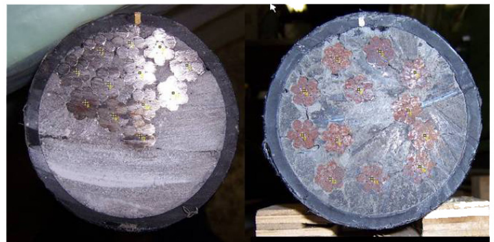
Bridge tendon cross sections showing varied configurations.

Based on these findings, the researchers developed a new procedure for analyzing the test results. The procedure is adaptable to commercially available software that can run on desktop computers, making it possible to quickly process data from hundreds of tendons. They also developed new vibration test field equipment and applied these methods on segments of the Sunshine Skyway Bridge. The equipment is compact, portable, and has a wireless remote actuator which allows testing to be done by a single operator. A step-by-step training manual is available with the equipment. This new equipment provides an additional, time- and cost-effective tool that will enhance bridge monitoring practice.