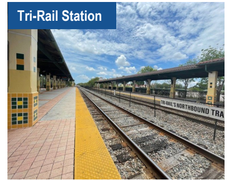
Example Station Platform Typical Section