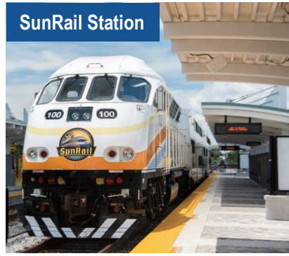
Existing Commuter Rail Station

The South Fort Lauderdale station provides access to downtown Fort Lauderdale, Broward Health Medical Center, the Broward County Convention Center, Port Everglades, and the Beaches.