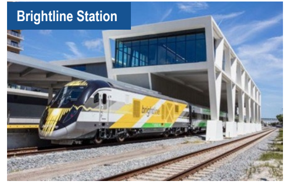
Existing Intercity Passenger Rail Station