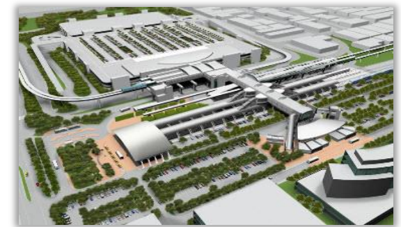
Miami Intermodal Center, Miami Dade County District 6, TRIP Project

How to Apply: Counties will be contacted by their District office and asked to submit candidate projects. More information may be obtained from the FDOT District Local Programs Administrator.