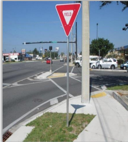
Traffic Operations Improvement, Columbia County CIGP Project, District 2

How to Apply: Counties (and municipal partners) submit a separate letter of application for each eligible project. Applications should be submitted to the District Office for the county in which the project is located. More information may be obtained from the FDOT District Local Programs Administrator.