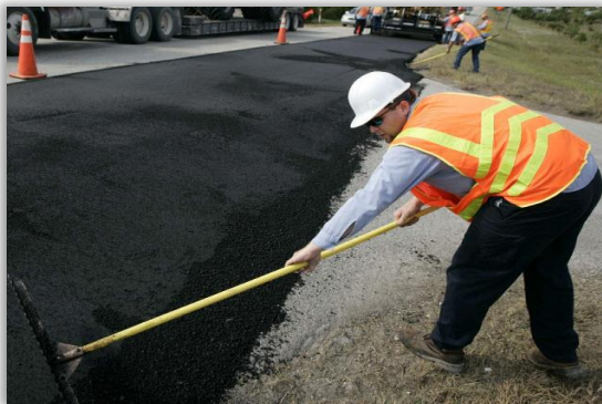
Lake Josephine Road, Highlands County District 1

How to Apply: Eligible counties will be contacted by their District office and asked to submit candidate projects. More information may be obtained from the FDOT District Local Programs Administrator.