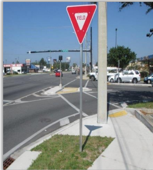
Traffic Operations Improvement, Columbia County CIGP Project, District 2

How to Apply: Counties (and municipal partners) submit a separate letter of application for each eligible project. Applications should be submitted to the District Office for the county in which the project is located. More information may be obtained from the FDOT District Local Programs Administrator.