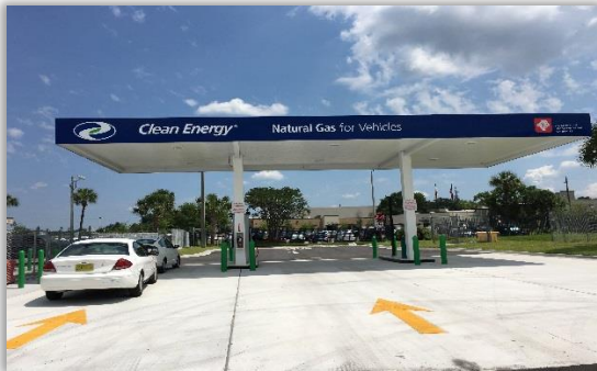
Clean Energy Facilities, Jacksonville Transit Authority TRIP Project, District 2

How to Apply: The regional entity (Metropolitan Planning Organization (MPO), Regional Planning Council (RPC), etc.) submits a priority list of projects to be funded through TRIP to the FDOT district.