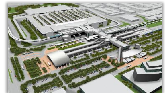
Miami Intermodal Center, Miami Dade County District 6, TRIP Project

How to Apply: Counties will be contacted by their District office and asked to submit candidate projects. More information may be obtained from the FDOT District Local Programs Administrator.