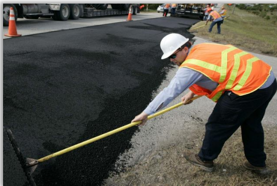
Lake Josephine Road, Highlands County District 1

How to Apply: Eligible counties will be contacted by their District office and asked to submit candidate projects. More information may be obtained from the FDOT District Local Programs Administrator.