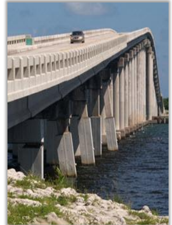
Card Sound Road Bridge – Monroe County SCOP Project District 6