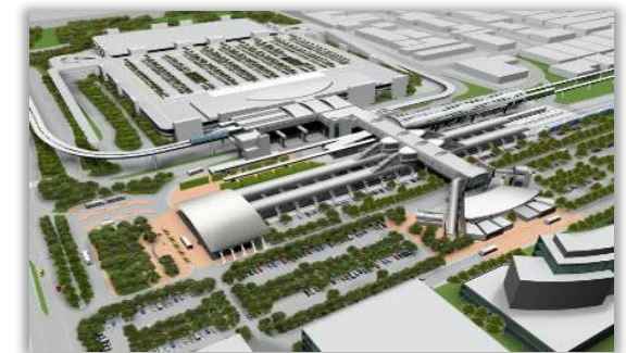
Miami Intermodal Center, Miami Dade County District 6, TRIP Project

How to Apply: Counties will be contacted by their District office and asked to submit candidate projects. More information may be obtained from the FDOT District Local Programs Administrator.