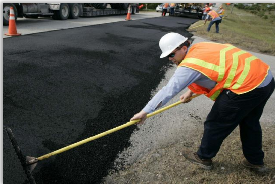
Lake Josephine Road, Highlands County District 1

How to Apply: Eligible counties will be contacted by their District office and asked to submit candidate projects. More information may be obtained from the FDOT District Local Programs Administrator.