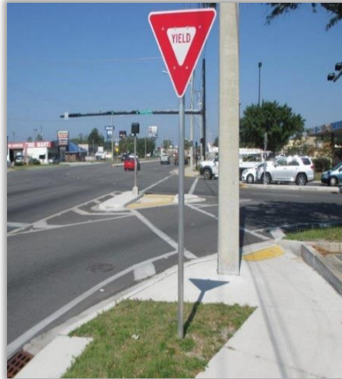
Traffic Operations Improvement, Columbia County CIGP Project, District 2

How to Apply: Counties (and municipal partners) submit a separate letter of application for each eligible project. Applications should be submitted to the District Office for the county in which the project is located. More information may be obtained from the FDOT District Local Programs Administrator.