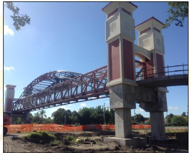
District 5: Innovative Project and Future Award Nominee: City of Sanford; Sanford River walk; Bike Path/Trail