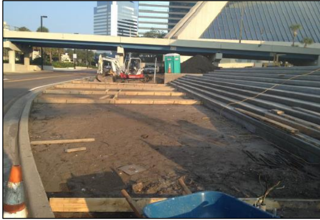
District 2: 2014-2015 APWA Project of the Year Award from the Northeast Florida Branch of APWA; City of Jacksonville; Chamber of Commerce Landscape Improvements