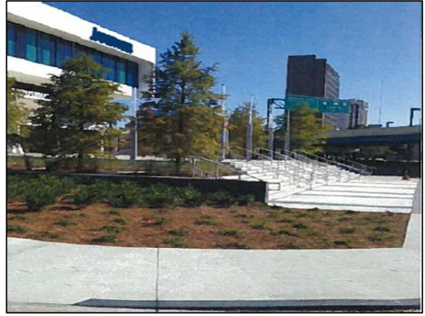
District 5: Innovative Project and Future Award Nominee: City of Kissimmee; Kissimmee Trail Over Pass; Bike Path/Trail