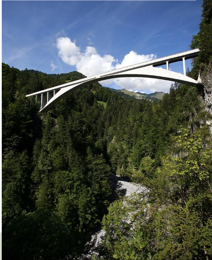
Schwandbach Bridge, 1930 R. Maillart