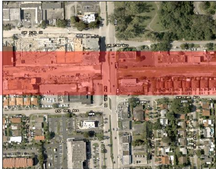
Overall length of bridge: 480 ft