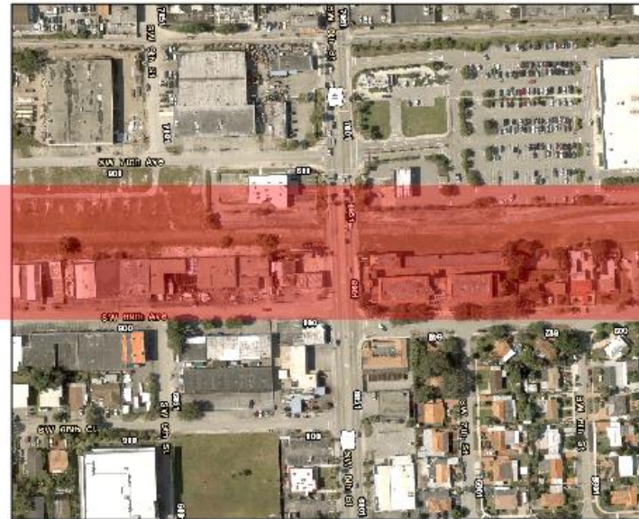
Overall length of bridge: 410 ft