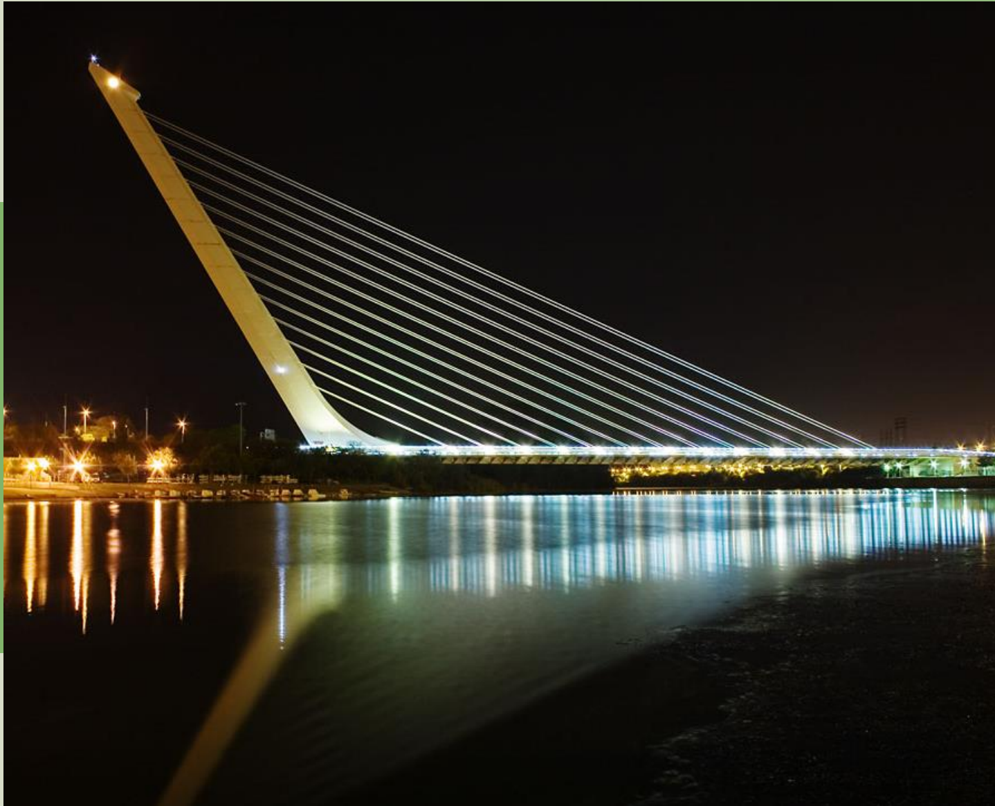
Alamillo Bridge, Sevilla, 1992. Santiago Calatrava