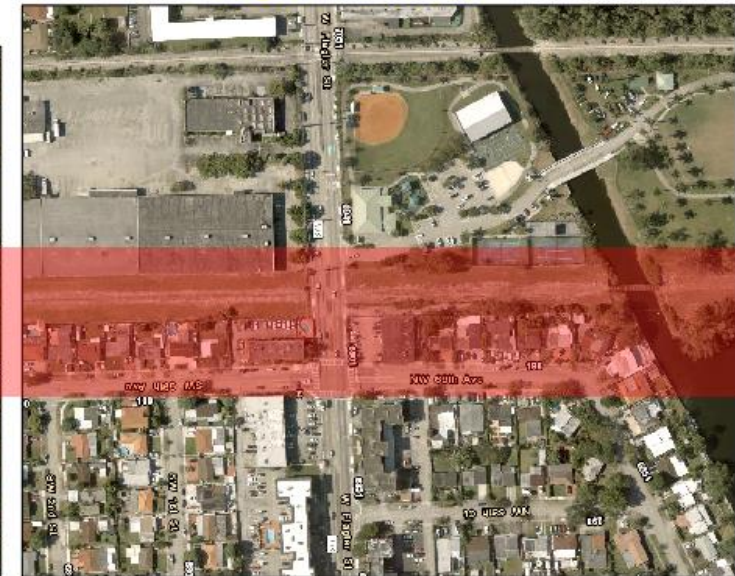
Overall length of bridge: 530 ft