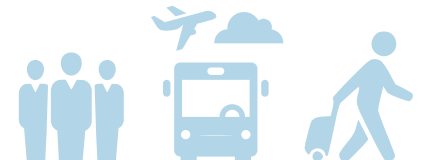
Passenger Terminals in Florida