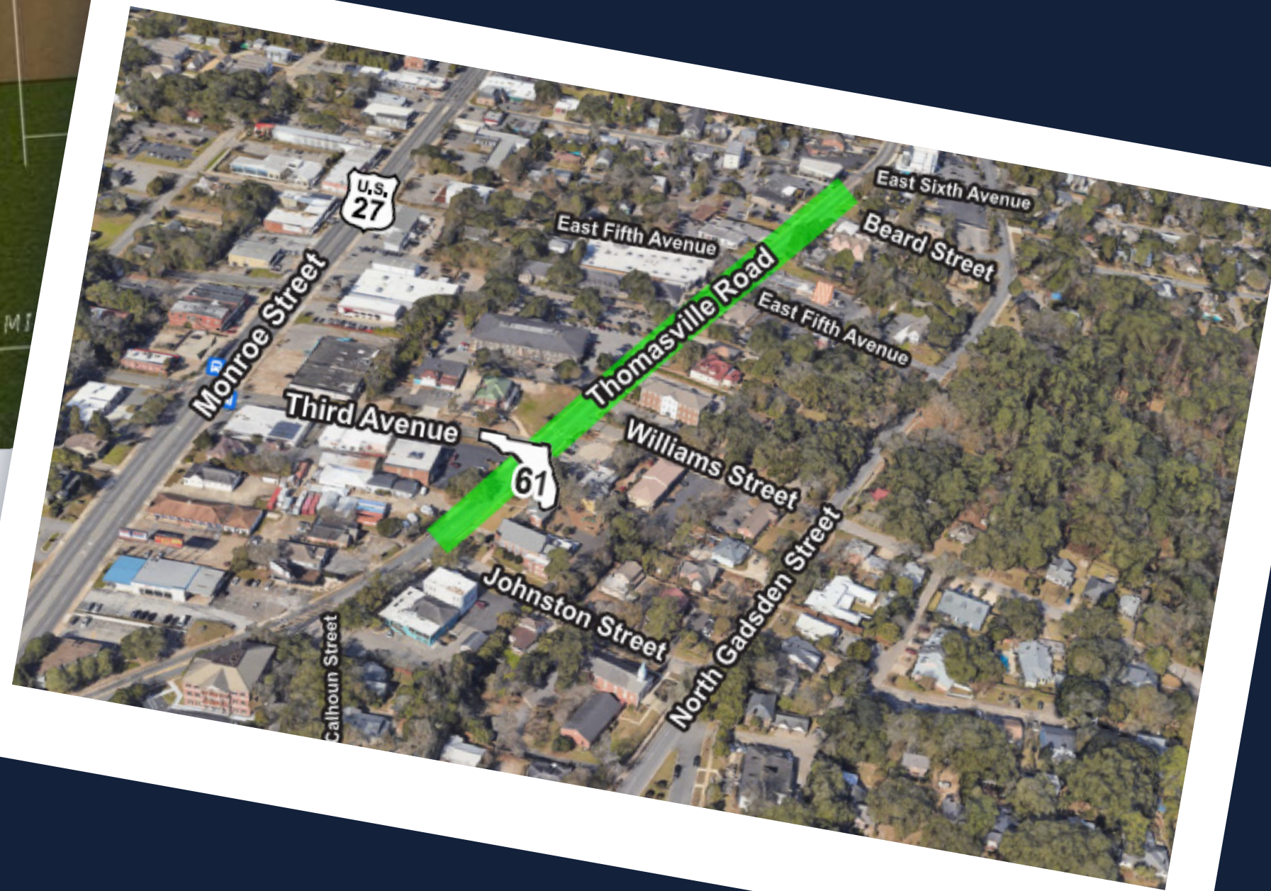
SR 61 (Thomasville Road) from Monroe Street to 9th Avenue