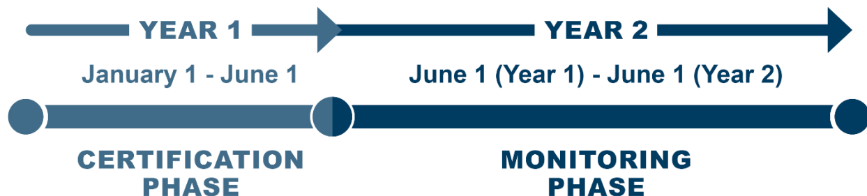
Figure 7.2 Risk Assessment Phases

The Risk Assessment has two main components: the Certification phase and the Monitoring phase. Each involve regular reviews, checks and monitoring. The Risk Assessment is conducted in January to review the MPO's processes for the prior calendar year. Between January and June 1 , the Risk Assessment is assessed, reviewed, finalized, and sent to FHWA. Once the Risk Assessment is final, the Monitoring phase begins. This phase will begin June 1 and will end May 31 of the following year. These dates represent invoice reporting periods. Figure 7.2 summarizes the Risk Assessment timeline and how the Risk Assessment phase can overlap from year to year.