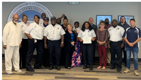
Transit supervisors from Star Metro, Escambia County Area Transit (ECAT), Big Bend Transit, and Wakulla Senior Citizens Council spent two-days in Tallahassee at Supervisor and Leadership Training for Florida Transit Agencies training.