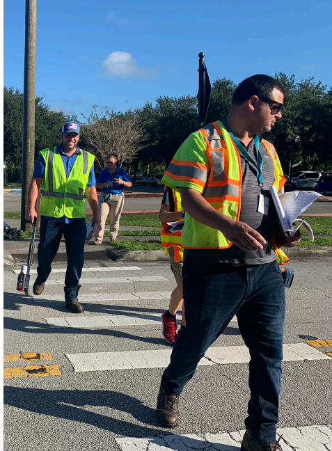
District 5 | City of Casselberry Walking Audit