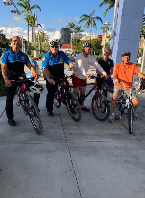
District 6 | Bike with the Chief