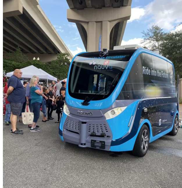
District 2 | JTA Riverside Market