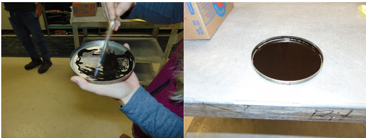
Figure 1 – Spreading the Emulsion in the PAV Pan