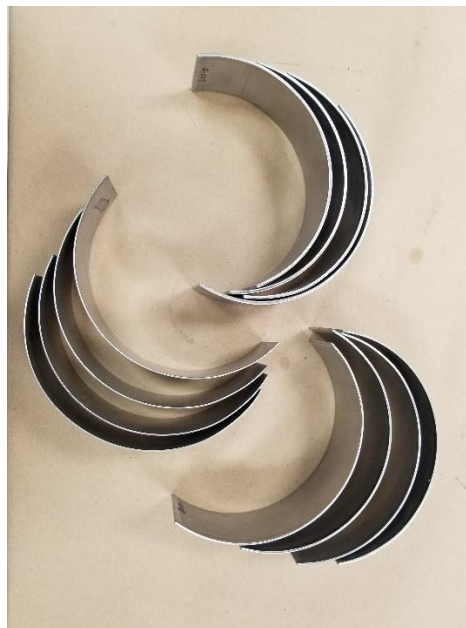
Figure 2. Shims of Varying Thicknesses to Accommodate a Core Sample with a Diameter < 6.00 in. and \geq 5.75 in.