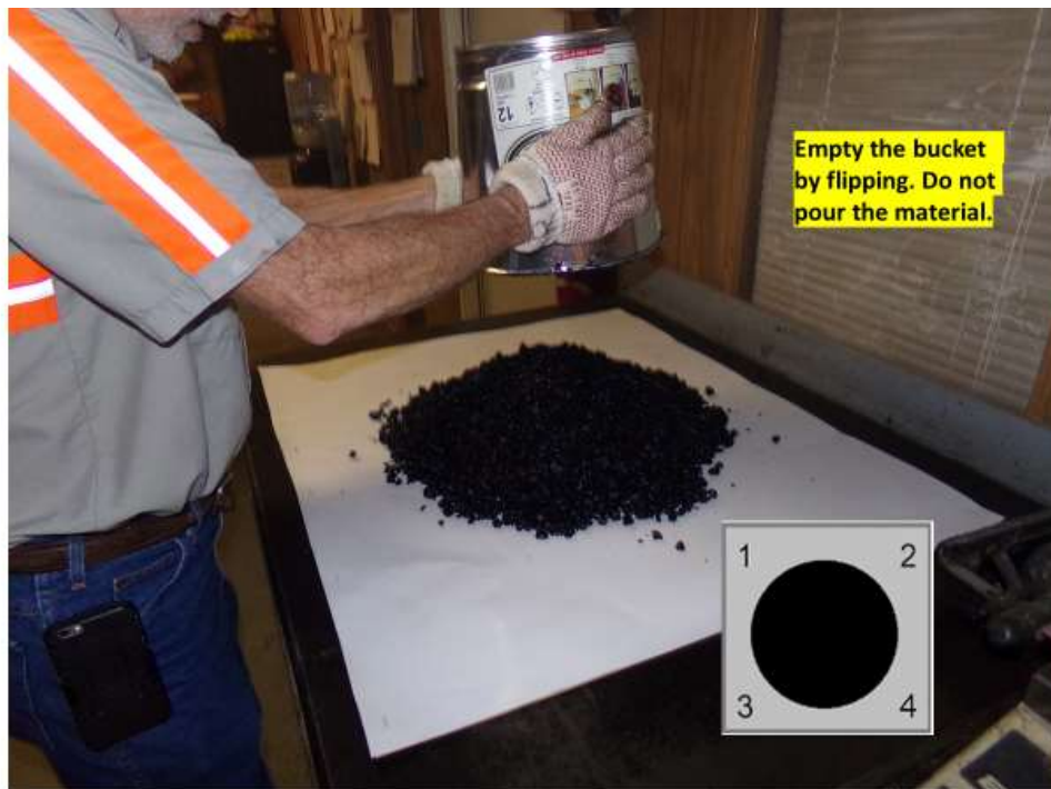
Figure 1. Emptying the sample bucket.