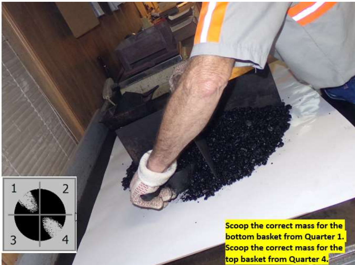
Figure 3. QC sample- bottom basket from Quarter 1 and top basket from Quarter 4.