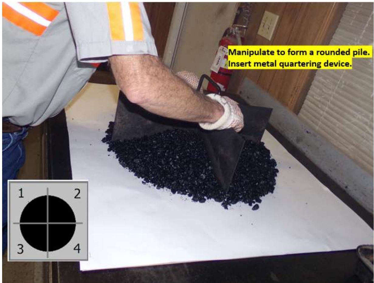
Figure 2. Rounded pile and metal quartering device.