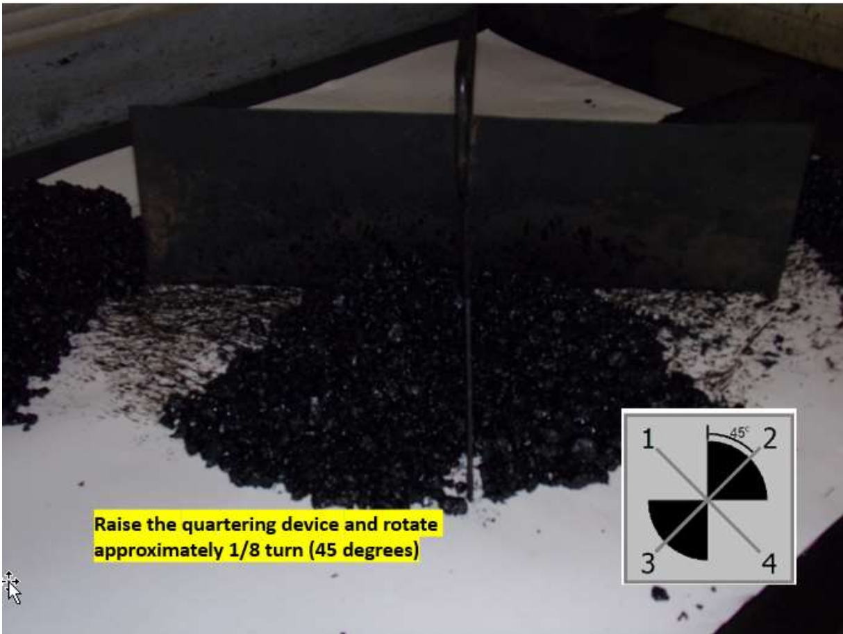
Figure 5. Raising and rotating the quartering device.