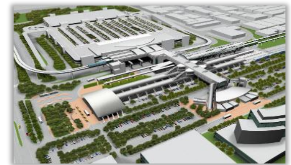
Miami Intermodal Center, Miami Dade County District 6, TRIP Project

How to Apply: Counties will be contacted by their District office and asked to submit candidate projects. More information may be obtained from the FDOT District Local Programs Administrator.