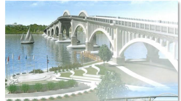
Veterans Memorial Bridge– District 5