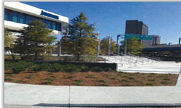
City of Jacksonville: Chamber of Commerce Landscape Improvements – District 2