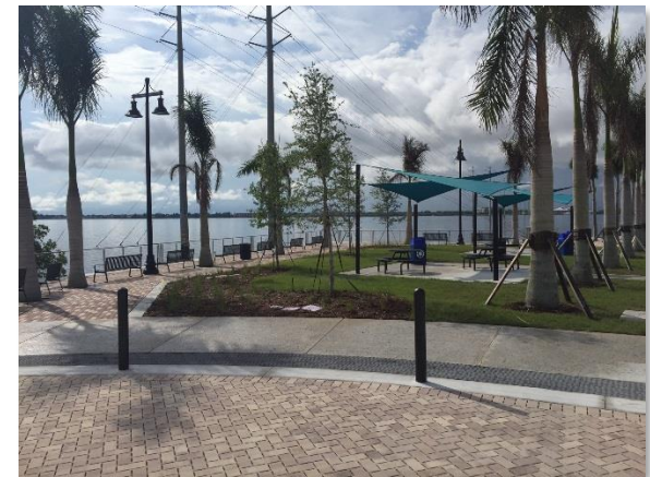
Gateway Harborwalk Phase 1 – District 1