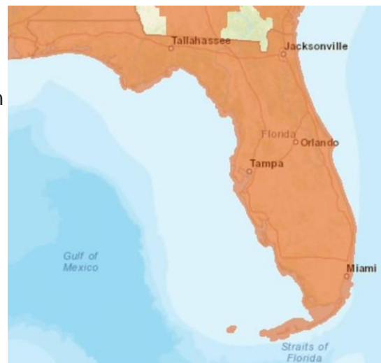
Range Map

No critical habitat has been designated for this species.