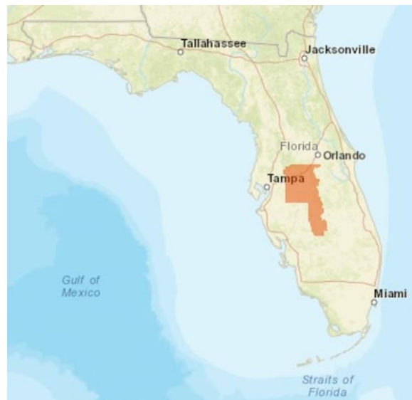
Range Map

No critical habitat has been designated for this species.