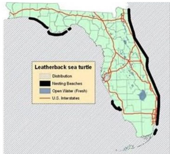
Range Map

There is final critical habitat for this species