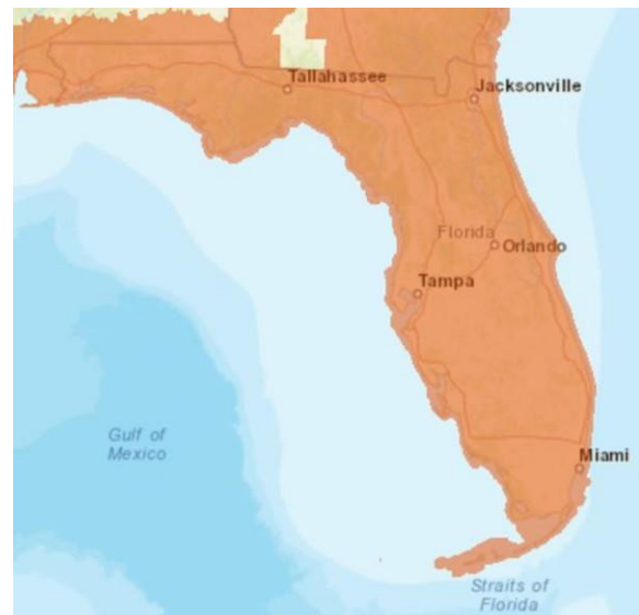
Range Map