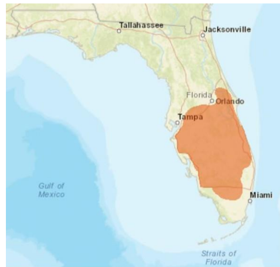
Range Map