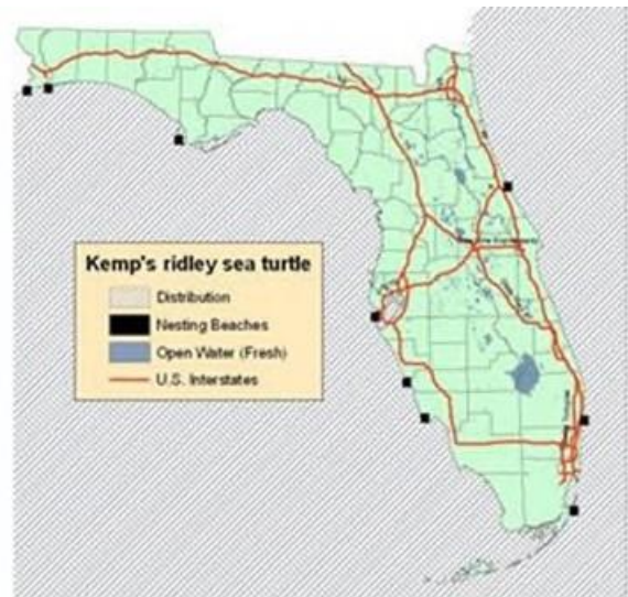
Range Map