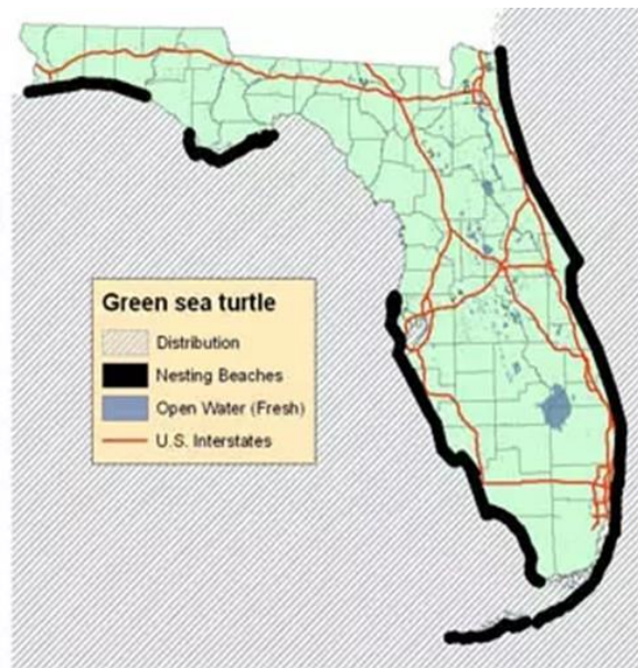
Range Map

No critical habitat has been designated for this species.