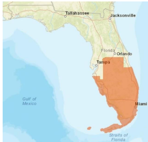
Range Map

No critical habitat has been designated for this species.