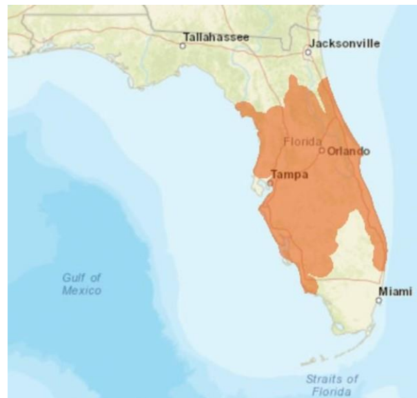
Range Map