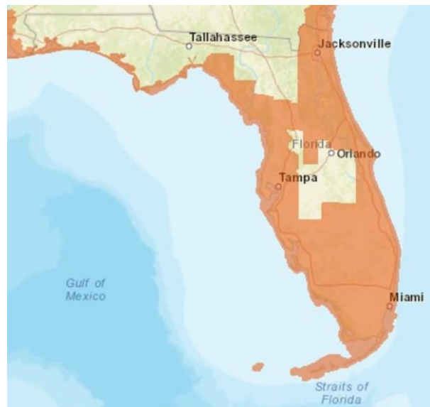
Range Map