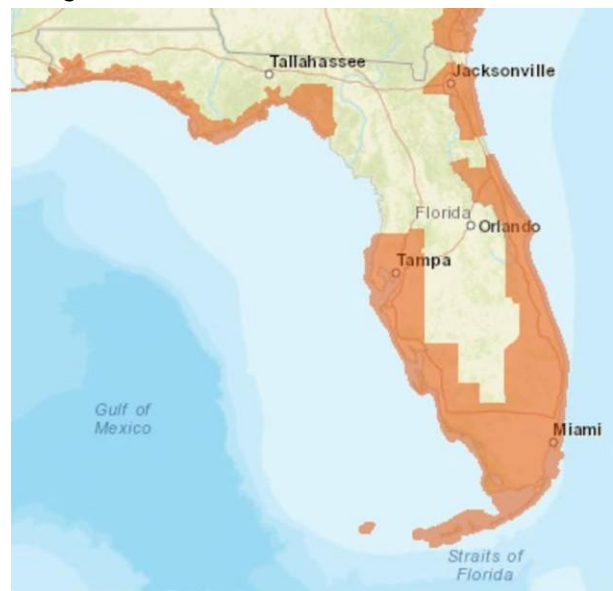
Range Map

There is final critical habitat for this species.