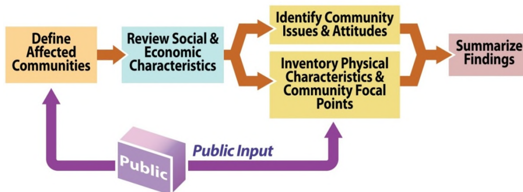
Figure 6–2: Process for Developing Community Information

In addition to transportation project information and environmental resource data, the ETDM process relies on sociocultural or community information to make informed decisions about affected communities. This includes data that define community boundaries; identify community focal points; and document community histories, goals, and values (see Figure 6-2 ). Combined with the information above, the Sociocultural Data Report (SDR) provides results on a number of economic, demographic, and social variables from the three most recent United States Census (Census) events, the American Community Survey (ACS), and Florida county property appraiser data.