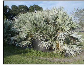
SILVER SAW PALMETTO