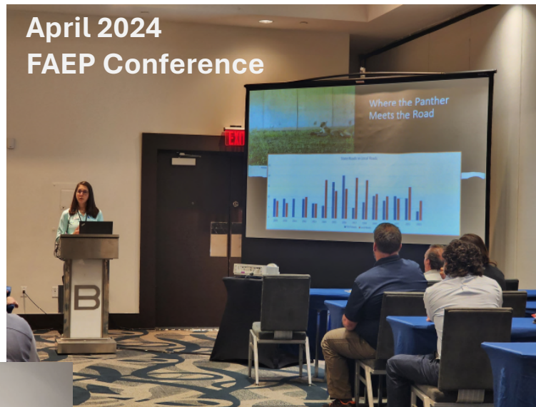
April 2024 FAEP Conference