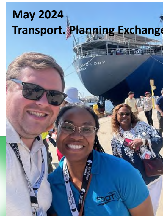
May 2024 Transport. Planning Exchange