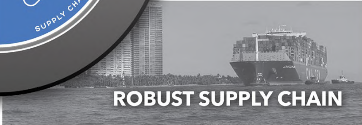
ROBUST SUPPLY CHAIN