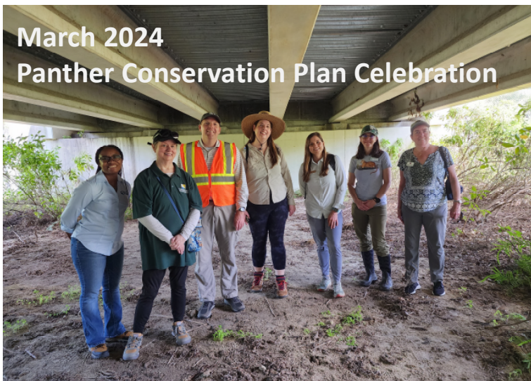
March 2024 Panther Conservation Plan Celebration