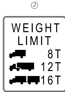
R12-5 (24" X 36")