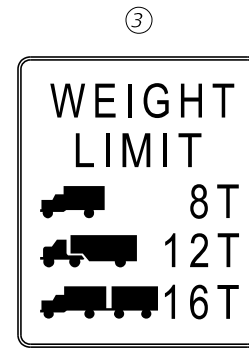
R12-5 (24" X 36")