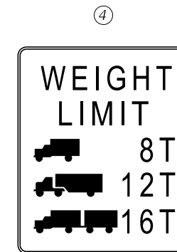
R12-5 (24" X 36")