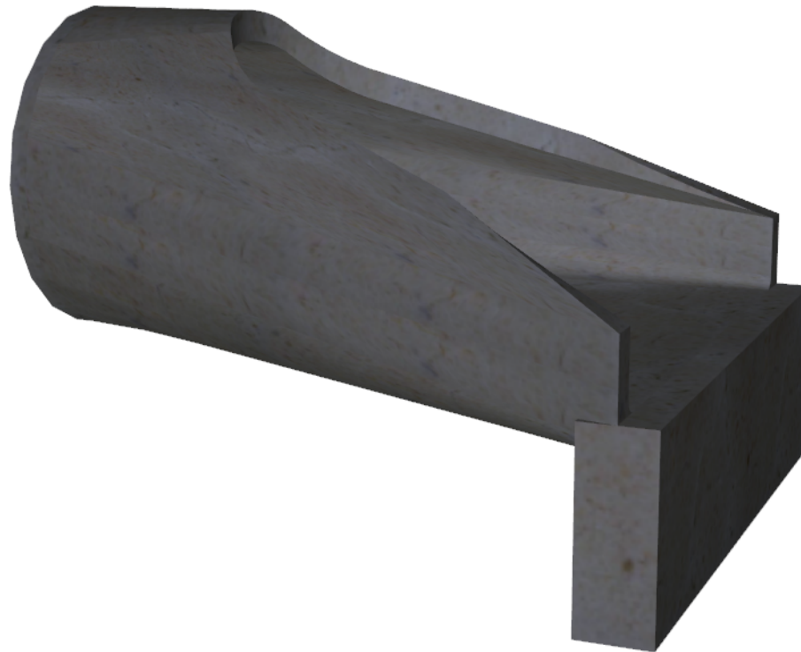
INDEX 430-020 Flared End Section (Straight Flare With 30" Pipe Shown, Optional Shape Similar)