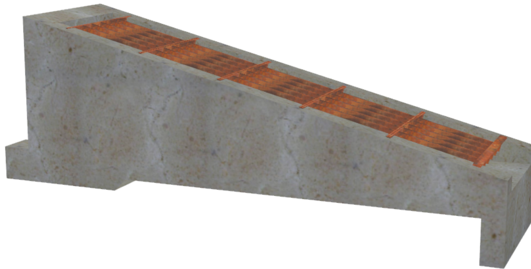
INDEX 430-010 U-Type Concrete Endwalls With Grates - 15" to 30" Pipe (30" Pipe With Grate Shown)