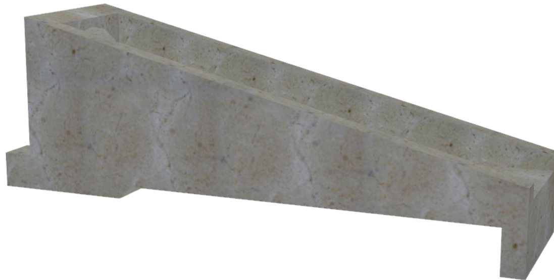
INDEX 430-010 U-Type Concrete Endwalls With Grates - 15" to 30" Pipe (30" Pipe Without Grate Shown)