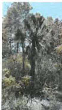
SABAL PALM TO BE PROTECTED