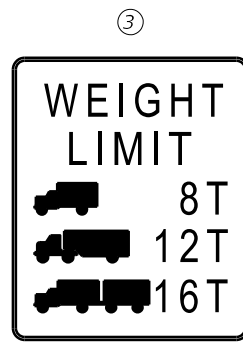
R12-5 (24" X 36")