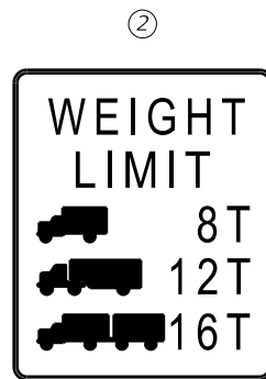
R12-5 (24" X 36")