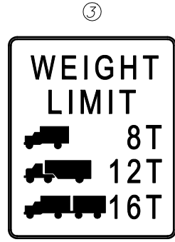
R12-5 (30" X 36")