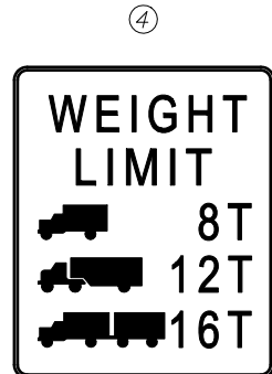
R12-5 (30" X 36")