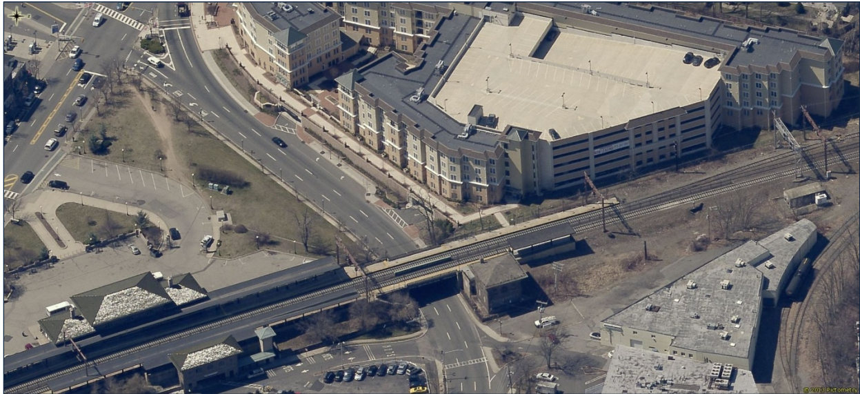
Figure 7 - Morristown Station Area with Joint Development Project in Upper Right Corner.

The City also benefited from the project because NJ Transit's surface parking lot had been tax exempt. Highlands at Morristown Station is paying property taxes and the city is also looking to execute a similar project on land that it owns near the station, which will add even more property tax revenue.