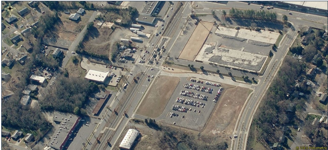
Figure 9 - Scaleyark Station with Portion of Joint Development Site Across Street.