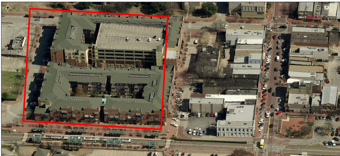
Figure 8 - Eastside Village I Outlined in Red with Station Below and Downtown to Right.

The development agreement for Eastside Village I called for 245,000 square feet of new housing and retail space abutting the western edge of the light rail platform. The project includes 234 apartments, 15,000 square feet of retail space, and 398 parking spaces. Amicus Partners have a 70-year ground lease with three 10-year renewal options. The property was valued at roughly $10 per square foot at the time of the negotiations between the city and developer, but they negotiated a value of $6 per square foot that takes into consideration the risk and uncertainty associated with a complex new form of development. The developer pays the city 10 percent of the negotiated value annually ($0.60 per square foot) with increases tied to the project's net income. The city also granted the developer a start-up incentive that discounted the lease by 75 percent for the first year and 50 percent for the second year.