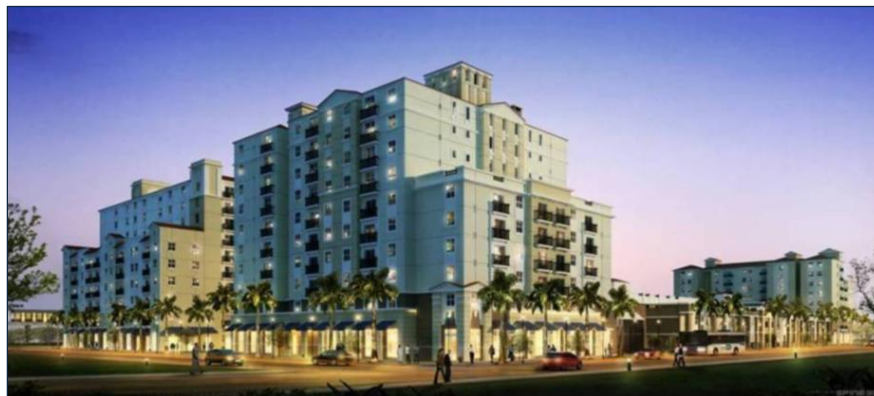
Figure 5 - Brownsville Transit Village Rendering. Image credit: Corwil Architects

Although financing affordable housing development, especially a project of this size divided into multiple phases, is a complex effort, from a joint development and TOD standpoint the Brownsville Transit Village was relatively straightforward. The project took an existing surface parking lot and redeveloped it for high density development by providing replacement parking in an onsite parking garage. By focusing on affordable housing, the development is targeted toward a market niche that is likely to be strongly supported by the surrounding neighborhood.