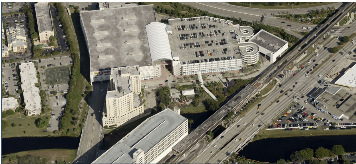
Figure 3 - Dadeland North Station Area and Joint Development Site.

The developer and Miami-Dade Transit agreed to a 99-year land lease in 1994. Miami-Dade Transit receives a guaranteed minimum land rent, and a gross rent payment based on a percentage of development revenues, which are five percent of the first $7 million, 5.5 percent of between $7 million and $10 million, and 5.5 percent of above $10 million. The phases and components of the project are shown in Table 5.