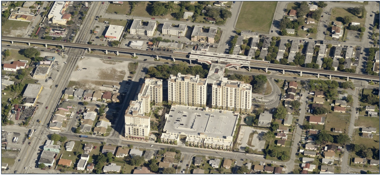
Figure 4 - Brownsville Station Area with Transit Village.

As part of the project the developer also provided several improvements to the infrastructure and general environment around the transit station. These improvements included upgrading water main extensions in two streets along the length of the site and reconfiguring the bus bay and drop off lanes at the station to improve traffic flow. The developer also improved landscaping in the station area.