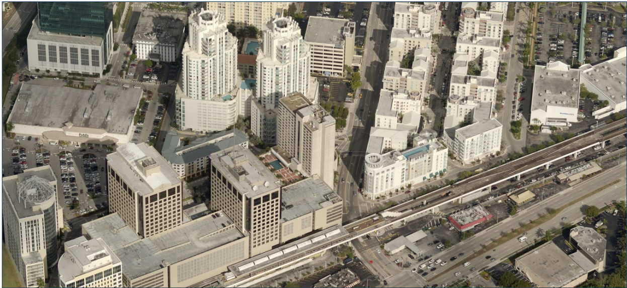
Figure 2 - Dadeland South Station Area.

The developer has a lease for the air rights for 99.5 years. The deal is structured with a 55.5-year lease followed by a renewal option for another 44 years. Miami-Dade Transit receives an annual lease payment of either $400,000 (adjusted for inflation) or a percentage of gross revenue from the development, whichever is greater. The gross revenue percentage varies by the project phase, from a high of four percent from Phases 1 and 3, to two percent from Phase 2, 1.5 percent from Phase 4A, and one percent from Phase 4B. The components and year opened for each phase are shown in Table 4.