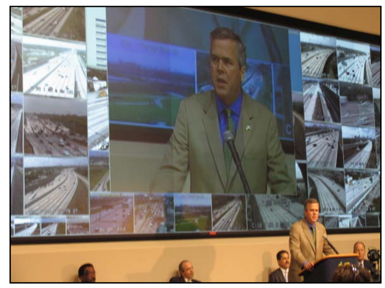
Above: SunGuide TMS dedications with then Governor Jeb Bush. Below: SunGuide TMC. Bottom: View of 95 Express.

The combination of enhancements made to its incident management, traveler information, and traffic management services have yielded significant travel benefits for the public. For example, the average annual roadway clearance time for an incident has been reduced from 50 minutes in 2004 to an average of 29.2 minutes today. This reduction in