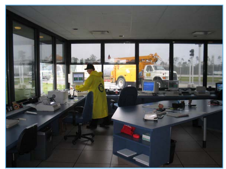
Weigh station facility work area.

Presently the MCSAW office is staffed by approximately 170 regulatory weight inspectors that are charged with performing commercial vehicle size and weight enforcement. The primary purpose of the MCSAW weight enforcement program is to protect Florida's highway system and bridges from damage from overweight vehicles. Vehicles are weighed at 20 fixed weigh station locations and mobile enforcement with portable scales statewide. Over 20 million vehicles are weighed annually.