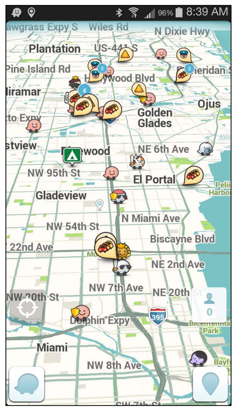
Wazers providing information.

FDOT has a robust intelligent transportation systems in place and is able to collect data on roadway conditions on about 60 percent of the state's limited-access facilities. Waze data can be a real benefit in non-covered areas to enhance our ability to know what is going on in areas that FDOT does not have instrumentation. The Waze data can also be a benefit to support the Federal Highway Administration's Real-Time System Management Information Program, included in Section 1201 of the Safe, Accountable, Flexible, Efficient Transportation Equity Act: A Legacy for Users. Section 1201 requires that state DOTs make real-time information regarding traffic and travel conditions as well as weather conditions on interstate facilities accessible to the public by