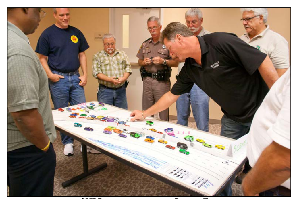
SHRP2 training exercise in District Four.

Following the Road Ranger trainings in April, District Four held its second annual presentation of the FHWA SHRP2 National TIM Responder Course in May. District Four operates three TIM Teams in Broward and Palm Beach Counties, and the Treasure Coast comprised of over 600 members. TIM teams help to establish working relationships with law enforcement, fire rescue agencies, contracted towing and hazardous material containment companies, and a wide variety of private contractor companies. Last year, training was provided to 127 emergency