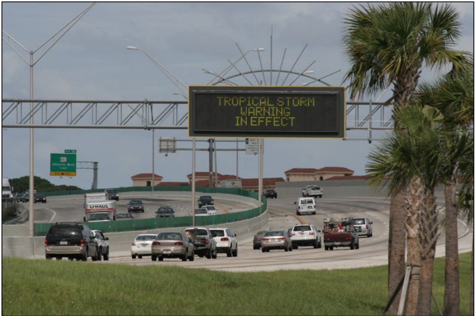
Dynamic message signs provide information to motorists.

With hurricane season upon us, and an increased chance for power outages, District Four realized the need to test the full generator system and its capabilities not just before a storm, but on a continual basis. District Four also wanted a way to visualize the site link status and display a generator status map in real-time on the RTMC video wall. If a connection failure occurs to any generator component, the site link changes from green to red and email alerts are sent out to the maintenance team.