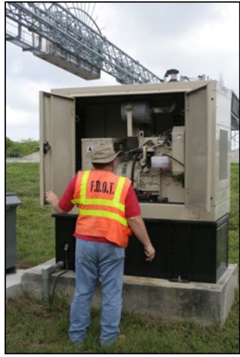
Generator maintenance in District Four.

SCADA gathers and analyzes real-time data from field generators and transfers the information back to the maintenance team, alerting them of any system critical information. Every second, over thirty data points are collected from each of the generators, such as: low fuel level, weak battery, overheat condition, etc. This is a web-based system that is capable of running on any workstation and communicating with multiple generator brands. Other notable features include: HTML 5 compatibility, smart phone compatibility, and expandability with Java or Java script programming.