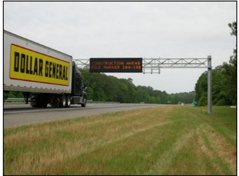
Existing DMS on I-10.

The Florida Department of Transportation (FDOT) District Three is in the final stages of procuring a design/build team for the I-10 Rural Freeway Management Systems from east of Pensacola to west of Tallahassee. This project will include an Internet protocol over Ethernet communications network running on 158 miles of gigabit (GB) fiber optic infrastructure. The fiber optic communications network will also extend 40 miles along US 231 to the Bay County transportation management center (TMC) to provide real-time center-to-center (C2C) connectivity for camera sharing and incident management. This project includes closed-circuit television (CCTV) cameras to provide nearly full coverage of the corridor as well as dynamic message signs (DMS), microwave vehicle detectors, travel time sensors, road/weather information sensors, highway advisory radio (HAR) systems, and a trail blazer system. Finally, the project will include a new traffic monitoring site within the District Three Chipley office campus that will supplement and be integrated with the District Three regional TMC in Pensacola and the City of Tallahassee/District Three regional TMC in Tallahassee. This project will allow redundant control and incident management support for this important recreational, commercial, and evacuation corridor in the Florida panhandle.