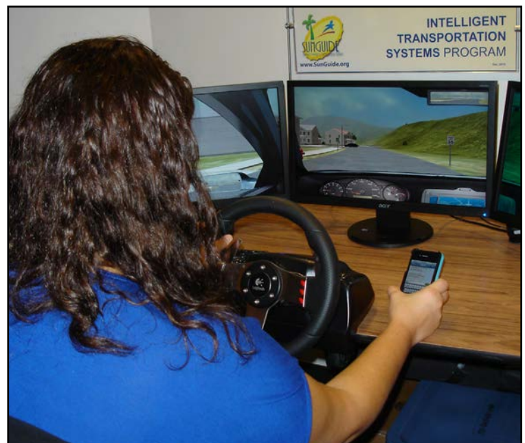
Participants were encouraged to take the “Distracted Driving Challenge” using a simulator provided by AAA.

The Florida Highway Patrol, Miami-Dade Expressway Authority, Florida’s Turnpike Enterprise, the Dori Slosberg Foundation, Florida’s Community Traffic Safety Teams, Florida Department of Highway Safety and Motor Vehicles, South Florida Commuter Services, Miami-Dade County, Miami-Dade Metropolitan Planning Organization, and AAA/Traffic Safety Foundation have all joined the campaign efforts as well.