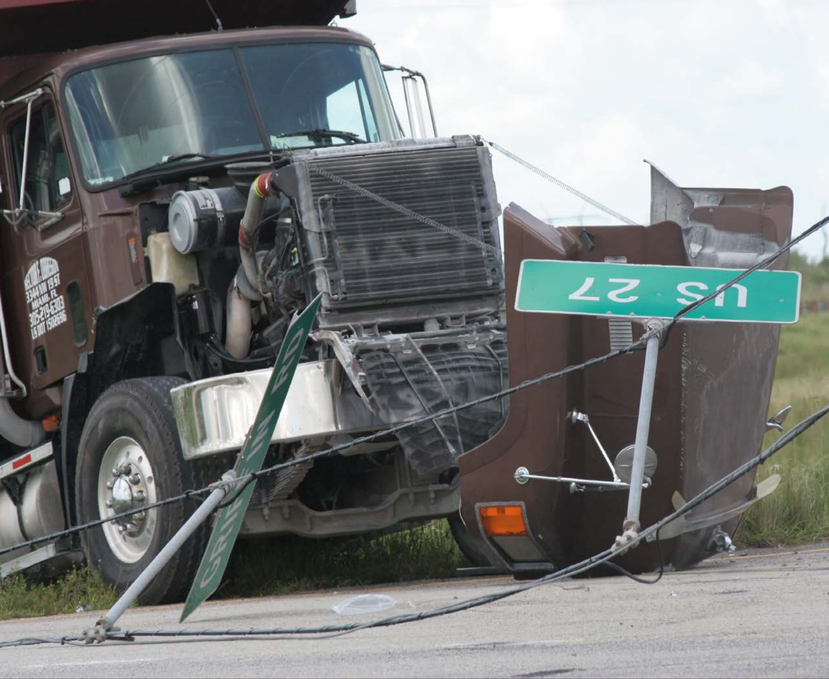
Commercial vehicle crash on US 27.

The ITS improvements will enhance the efficient movement of goods and services, providing traffic information and travel times to truckers and other motorists. There are few cross streets along this remote section of US 27 and no convenient detours between I-75 and SR 80. Real-time alerts about crashes and other lane-blocking incidents will enable motorists to adjust their route before entering the facility and avoid delays. In the past few years, there have been a number of severe crashes that forced the closure of the highway for hours. One of the most tragic was a crash in February 2010, involving a tractor trailer and a truck towing a livestock trailer. The incident resulted in a fatality and the death and injury of dozens of farm animals.