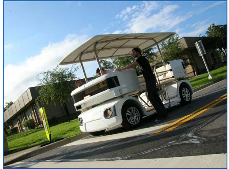
Autonomous guided vehicle at TERL.

The TERL hosted the AGV demonstration on August 13, 2012, after almost a week of setup and fine-tuning at the TERL. The demonstration at the TERL enabled safe operation of the AGV along the roadways and through signalized intersections that are part of the TERL campus. The demonstration started with a 15-minute presentation detailing how the AGV operates and ended with a 15-minute demo ride.