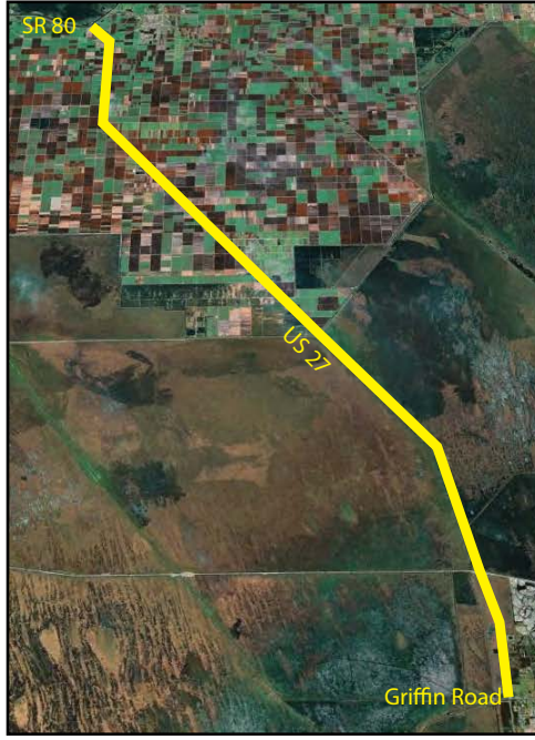
46-mile ITS project on US 27 in District Four.

The project extends 46 miles, from Griffin Road south of I-75 to State Road 80 in South Bay. The four-lane highway is heavily used by trucks hauling gravel from a rock quarry along US 27 as well as trucks carrying harvested sugar cane to processing mills in western Palm Beach County. It is also a major long-haul truck route.