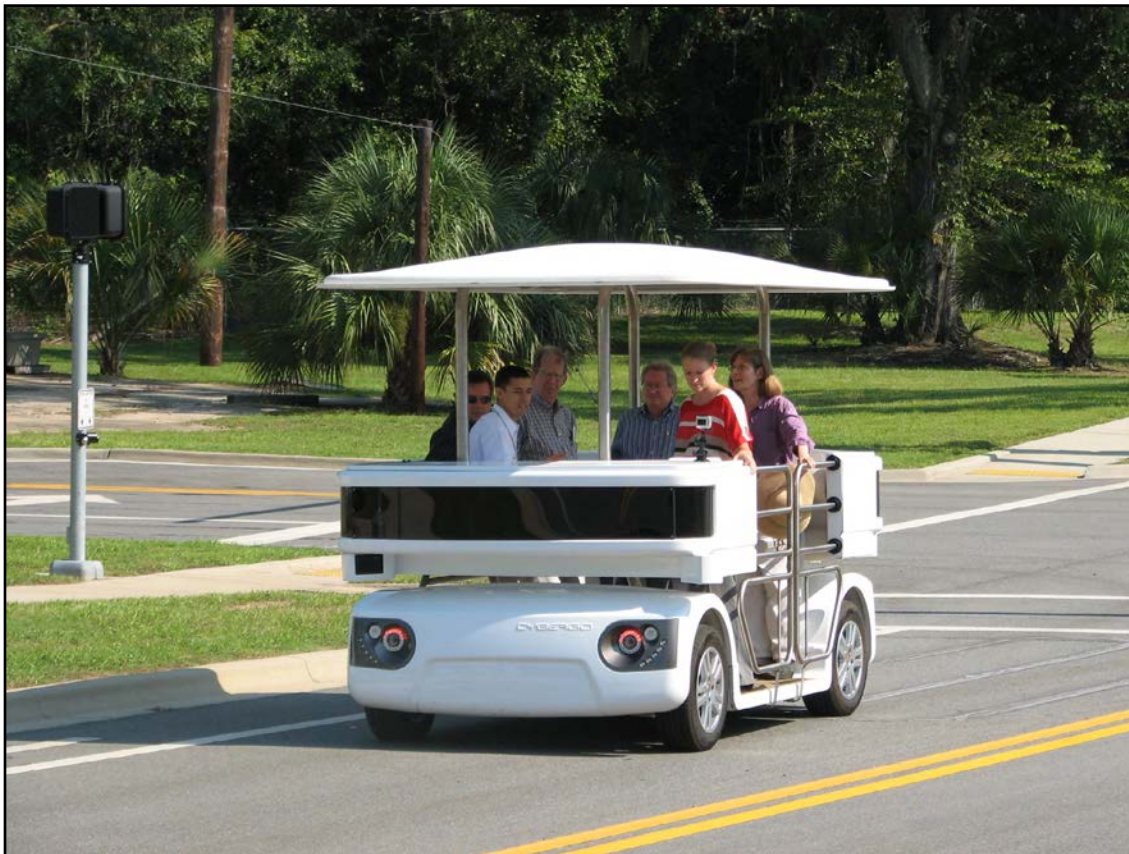
Demo ride in the autonomous guided vehicle.

movement. It is electric-powered and recharges by induction, a wireless charging system, to transfer energy at each scheduled stop. Since the AGV is a zero-emission electric vehicle, it is also environmentally friendly.