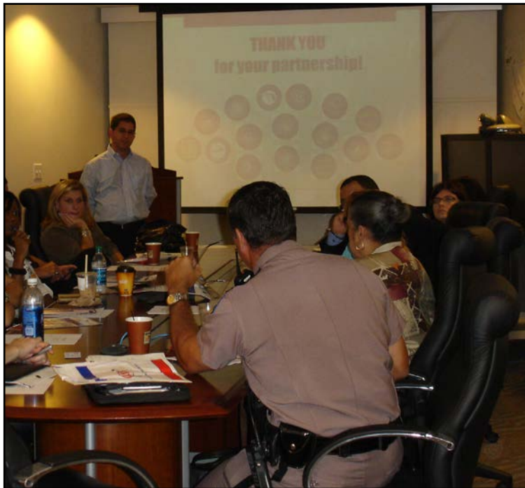
Representatives from the partner agencies discuss contributions to the campaign.