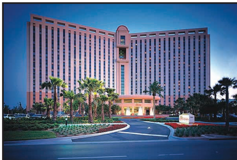
Rosen Centre in Orlando, Florida