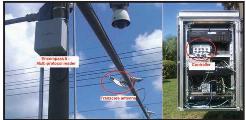
Transcore AVI system on the TERC's mast-arm facing north.