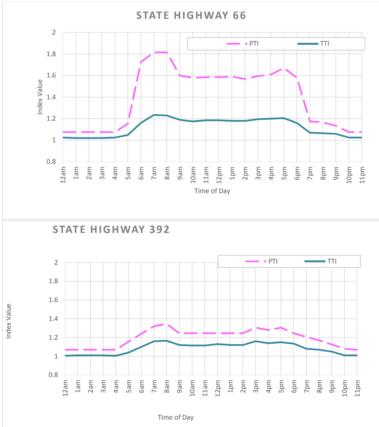
Figure 5-2: Travel Time Index and Planning Time Index throughout the Day

A literature review has been conducted to determine if there was a BI threshold to indicate non-recurring congestion. Results of the review were inconsistent with agencies that use this measure to identify non-recurring congestion using a variety of measures generally ranging from 0.25 to