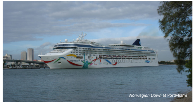
Norwegian Dawn at PortMiami

Port Canaveral has seven cruise terminals, and two planned cruise terminals, and is the current home to seven year-round cruise ships. With what port officials tout as the largest year-round fleet in the state, Canaveral has seen a steady and consistent growth in passengers. In 2012 Port Canaveral had 3.76 million revenue passengers and an estimated 4 million in 2013. This includes gaming cruises and both embarkations and debarkations. Port Canaveral passenger count is projected to be more than 5 million by 2015. The cruise lines that home-port at Canaveral are Carnival Cruise lines, Disney Cruise lines, Royal Caribbean and Victory Casino Cruises. In 2011, the port had a 35 percent increase in port-of-call cruise visits to 116 total calls, increasing to 168 in 2013.