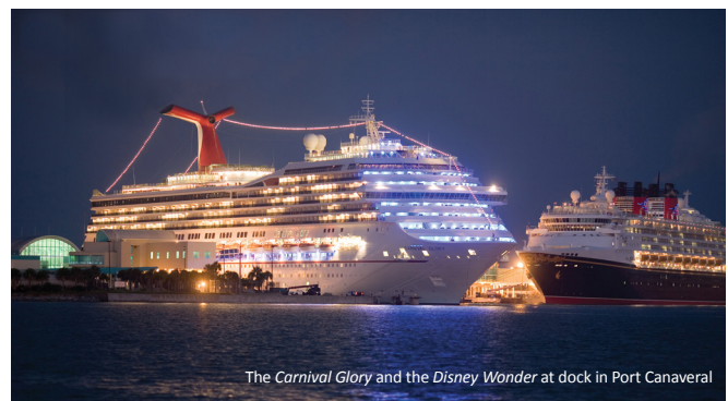
The Carnival Glory and the Disney Wonder at dock in Port Canaveral

To this end, consistent with the challenges and objectives expounded upon within the text of this