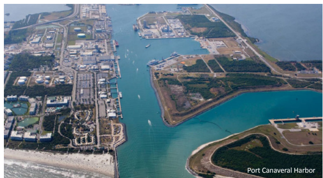
Port Canaveral Harbor

In order to estimate the overall impact of the Florida cruise industry, a Florida-specific U.S. Maritime Administration (MARAD) Port Kit was utilized. This is the same version used by the State to evaluate the return on investments anticipated from port investments. This software determines the regional economic impact of cruise ship embarkations and debarkations. Key input factors that influence how much of an impact is felt include number of vessel calls; average number of passengers per cruise call; voyage type (multi-day or daily); passenger mode of transportation to port; and average number of hotel nights spent pre or post cruise. It is important to note that the numbers reported only reflect the effects of port visits on a region. They do not reflect the additional impacts associated with corporate offices, dry-docking, and other related impacts. A summary of the outputs from the MARAD Port Kit, adjusted to 2013 dollars, is shown in Table 7.