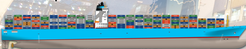
New Panamax (1,200 feet long by 160 feet wide and carries 12,500 TEUs)

Panamax containership capacity has more than doubled with the expanded Panama Canal.