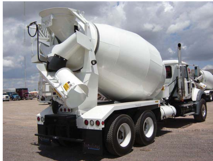
Concrete drums must be washed out at the end of each day, and the EPA classifies truck wash water as a hazardous substance, which must be disposed of in settling ponds on-site at concrete plants.

Following this series of studies, FDOT specifications for concrete were examined and revised. While FDOT still requires only fresh concrete for structural concrete applications, such as prestressed girders, pier columns, road surfaces, and other load-bearing applications, FDOT revised its specifications to allow the mixing of stabilized wash water with fresh concrete for non-structural uses, such as sidewalks, ditches, and other non-load bearing applications.