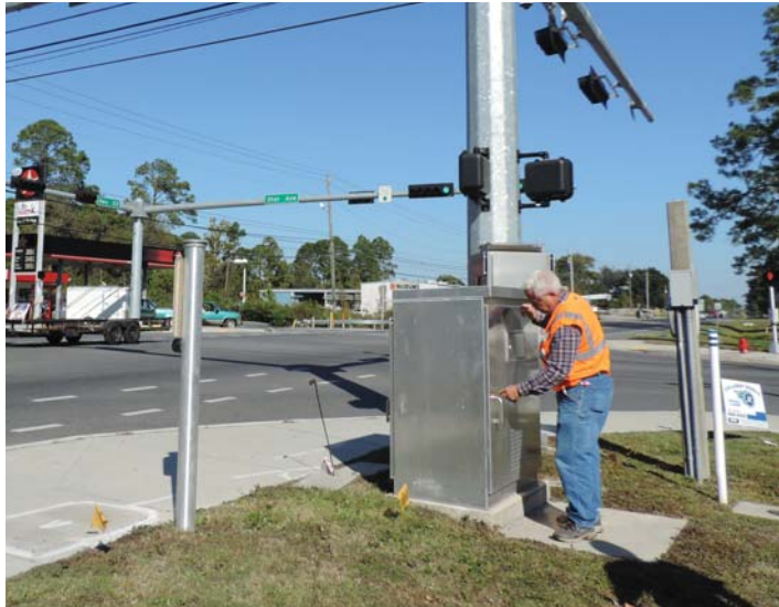
A worker accesses a traffic control box at a typical Florida intersection. These ubiquitous cabinets house Actuated Signal Controllers that control the traffic signals, pedestrian signals, and other electronic devices and are used to regulate both vehicular and pedestrian traffic at intersections.

Testing traffic signal controllers for use at signalized intersections across Florida is a time-consuming and tedious job that can only be completed by highly experienced testing personnel. However, researchers at Florida State University (FSU) working together with the staff at the Florida Department of Transportation (FDOT) Traffic Engineering Research Laboratory (TERL) developed a set of automated testing tools which greatly simplify and speed up the testing process. Because the suite of testing tools conforms to the National Transportation Communications for ITS Protocol (NTCIP), this new method of testing is manufacturer-independent, which further shortens the time commitment required for thorough testing.