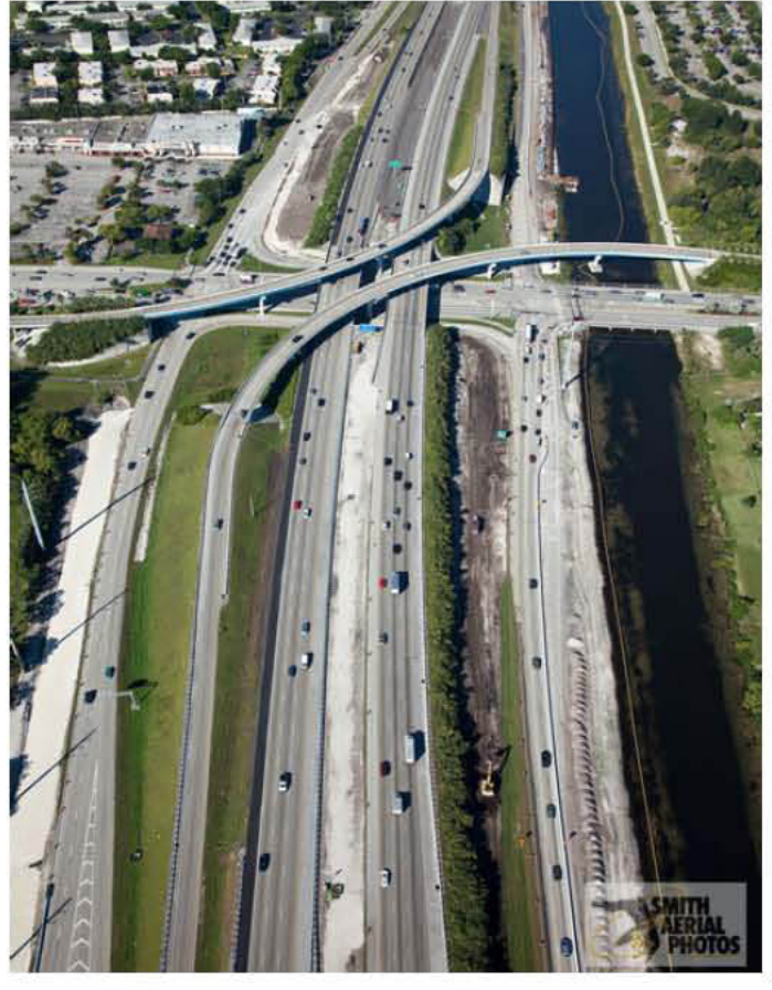
I - 595 ReconstructionFt. Lauderdale, FL.P3 ProjectCost = 1,200,000,000.00