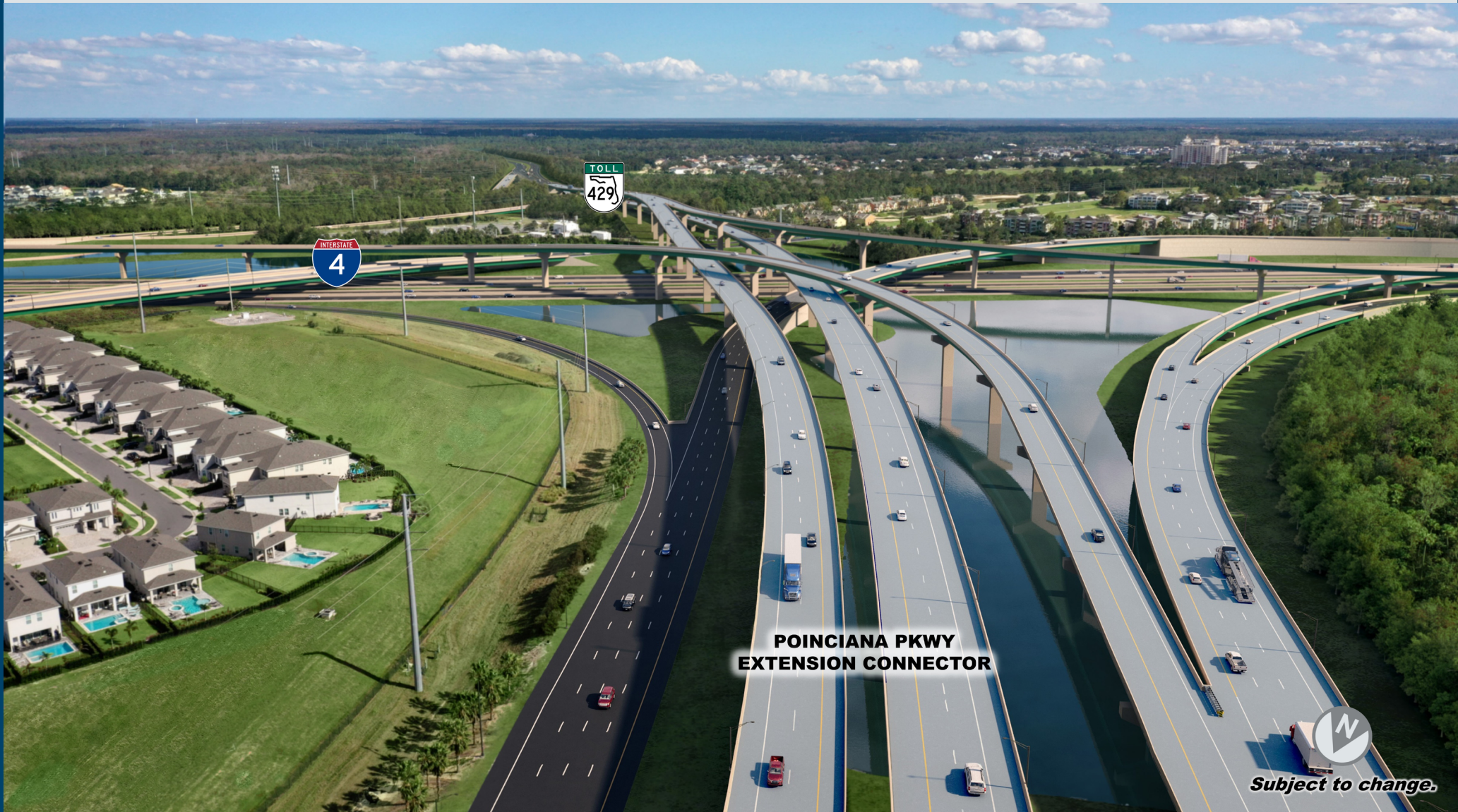
POINCIANA PKWY EXTENSION CONNECTOR